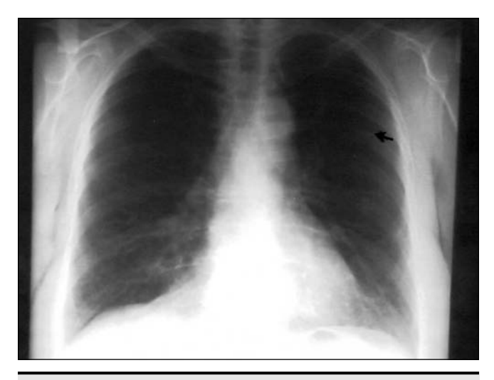
Fig. 2: Chest radiography, June 1997, showing regression of the lesions; the arrow indicates one residual abnormality.

several new, small, rounded and well-defined soft tissue masses no larger than 5 mm in diameter; they were judged consistent with metastatic cancer. By November 1996 chest radiography revealed multiple cannonball lesions (Fig. 1).